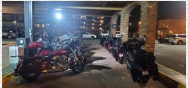
Legislative fundraising ride, motorcycles at rest.