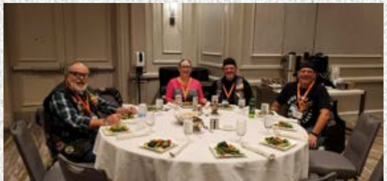
Meeting of the Minds Atlanta, 2021. ABATE of GA members event volunteers waiting for the banquet to start.