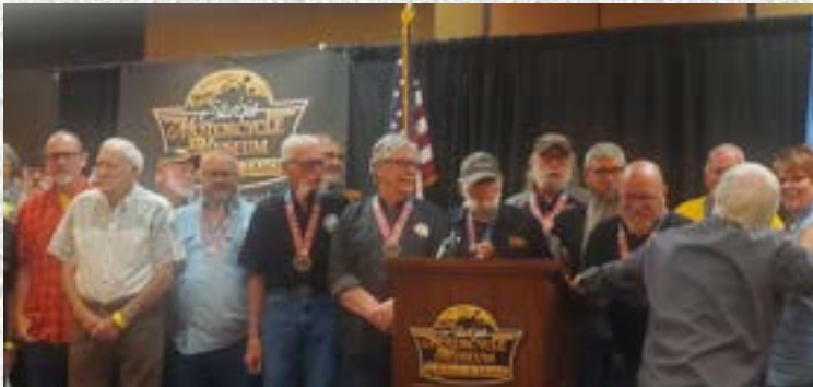
2022 Motorcycle Hall of Fame Freedom Fighters and other inductees. MRF was inducted in August 2022