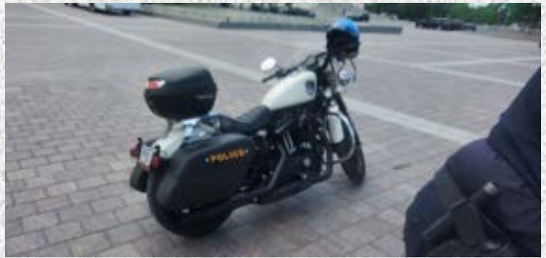
Washington DC, Bikers Inside the Beltway 2022. Capital Police motorcycle. They've graduated to HDs