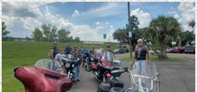
District 15 first membership ride after reactivating.